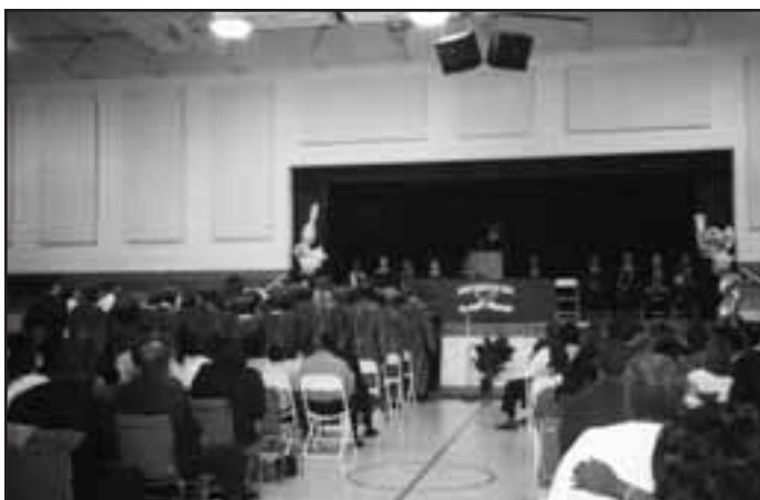
The seniors all rise to cross stage and receive their diplomas.

Teachers also presented 19 certificates of achievement to students in math, science, social studies, language arts, physical education, science, history, music, computer science, Spanish and study skills. continued on page 3