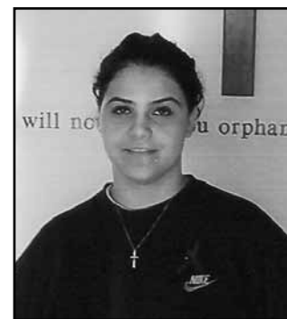
Snyder Campus student contest winner.

Our student, who attends Western Alamance High School, won $150 and advanced to the district competition where she received honorable mention.